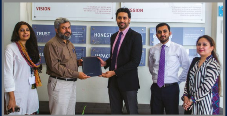
White House Grammar School