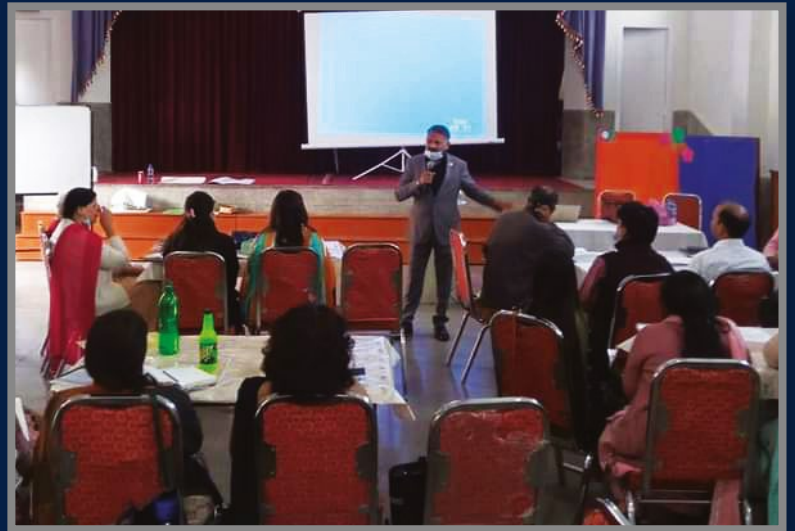
Presentation Convent Rawalpindi