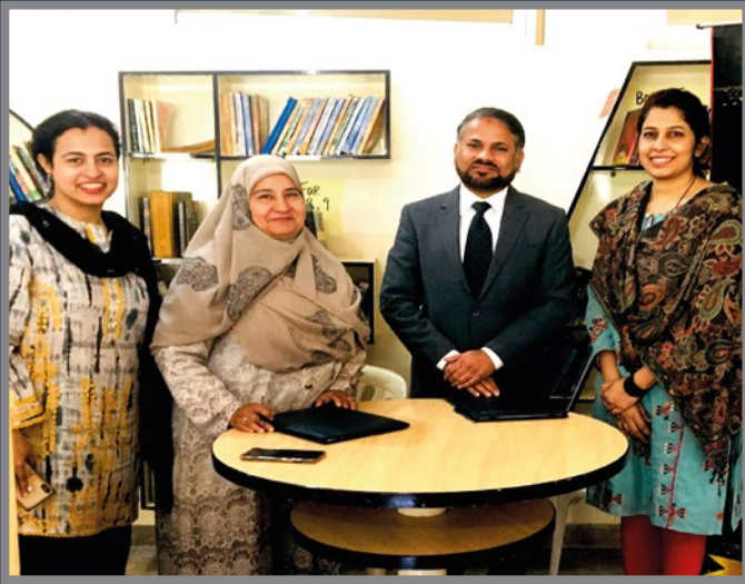
Beacon Light Academy